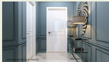
100 SQ. FT. PRIVATE ENTRANCE LOBBY