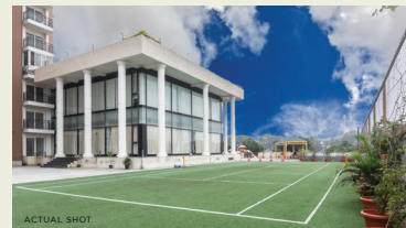
18,000 SQ. FT. CLUBHOUSE WITH 30+ AMENITIES