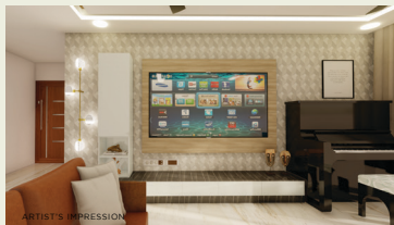
2 RESIDENCES PER FLOOR